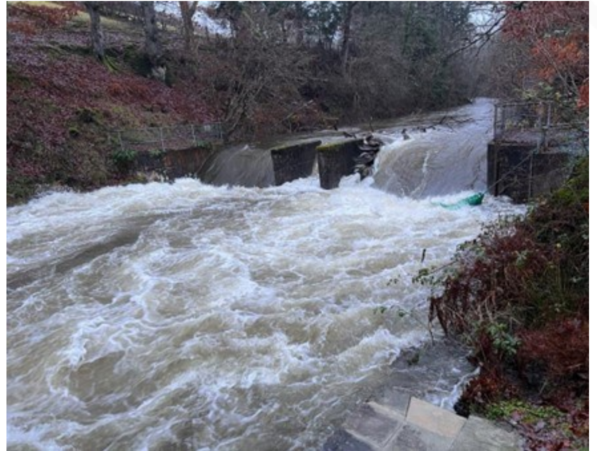
High Flows at Cribynau Weir