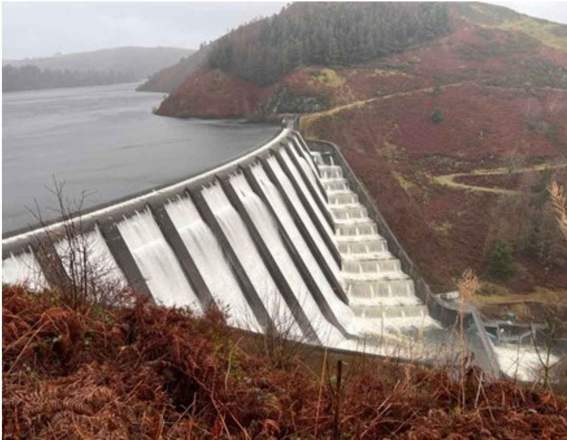
Clywedog Reservoir Overspill